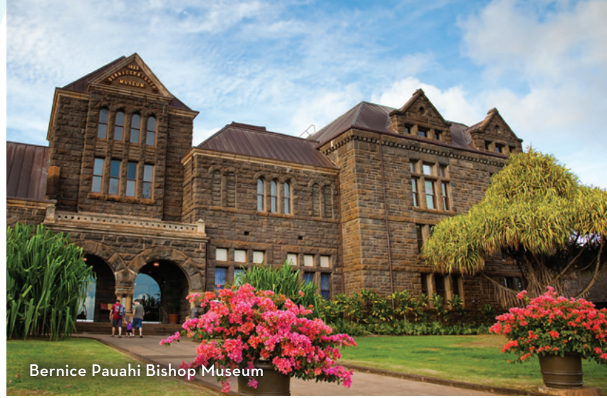
Bernice Pauahi Bishop Museum

Offering majestic mountain views on one side and the Pacific on the other, the ranch offers an exhilarating array of outdoor fun by ATV, catamaran, ebike, jeep, zipline or horseback. Set on 4,000 acres, the historic family-run business offers a variety of tours including their Mālama ka 'Āina voluntourism cultural experience in their lo'i kalo (taro patch) and their very popular Jurassic Movie Tour. ▶ kualoa.com