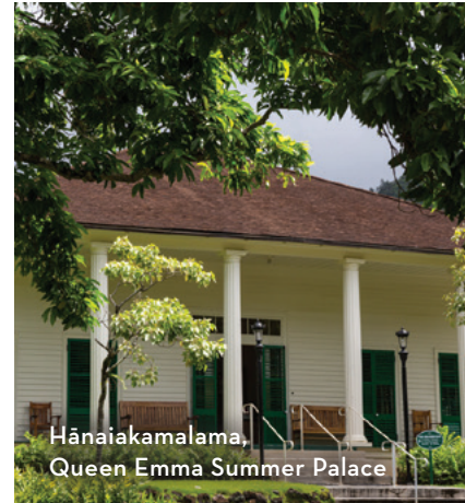
Hānaikamalama, Queen Emma Summer Palace