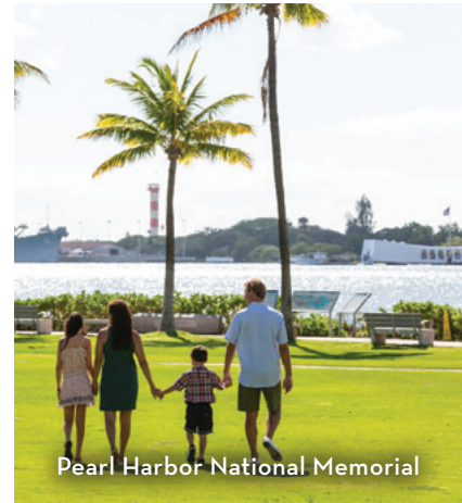
Pearl Harbor National Memorial